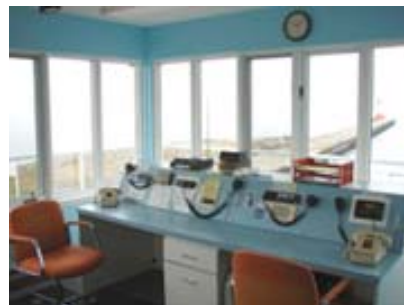
Radio room at TOWARF

Two appeals for e-mails side by side? YES - we really do need your e-mail address. Note that if you change your mind about the Squadron sending information that way, Fraser will take you off the list.