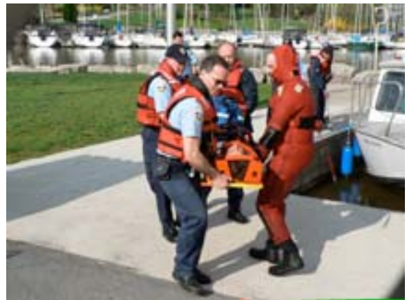
It really was just a practice run