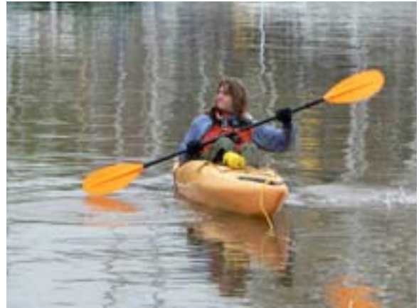
A lovely day to be close to the water